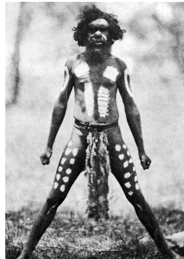
At a Corroboree