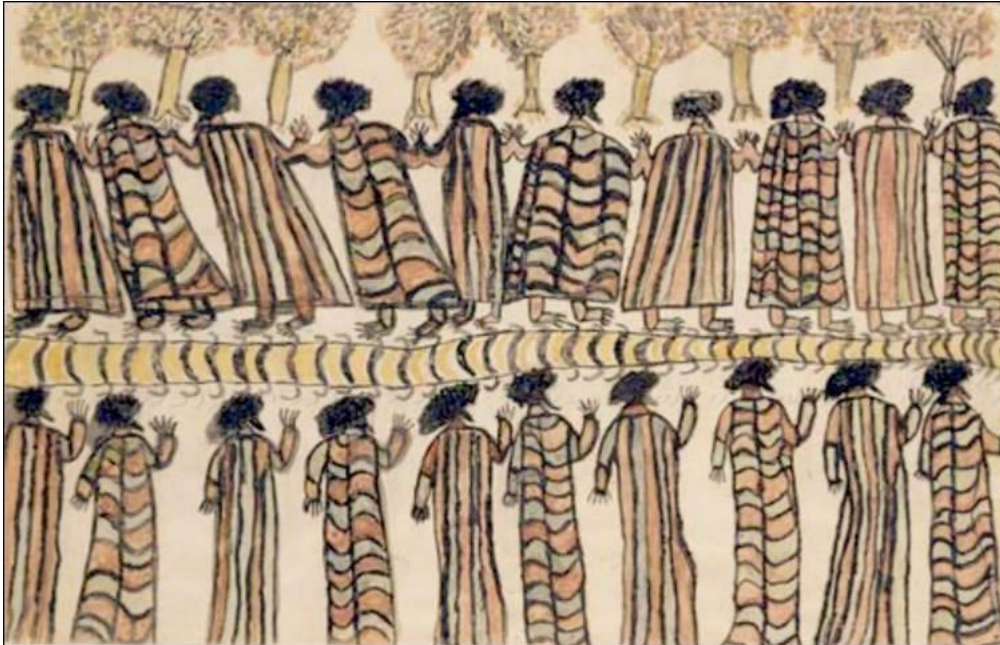
A painting by William Barak

Today, we remember and respect the Wurundjeri people as the original caretakers of the land where we live, play, and learn.