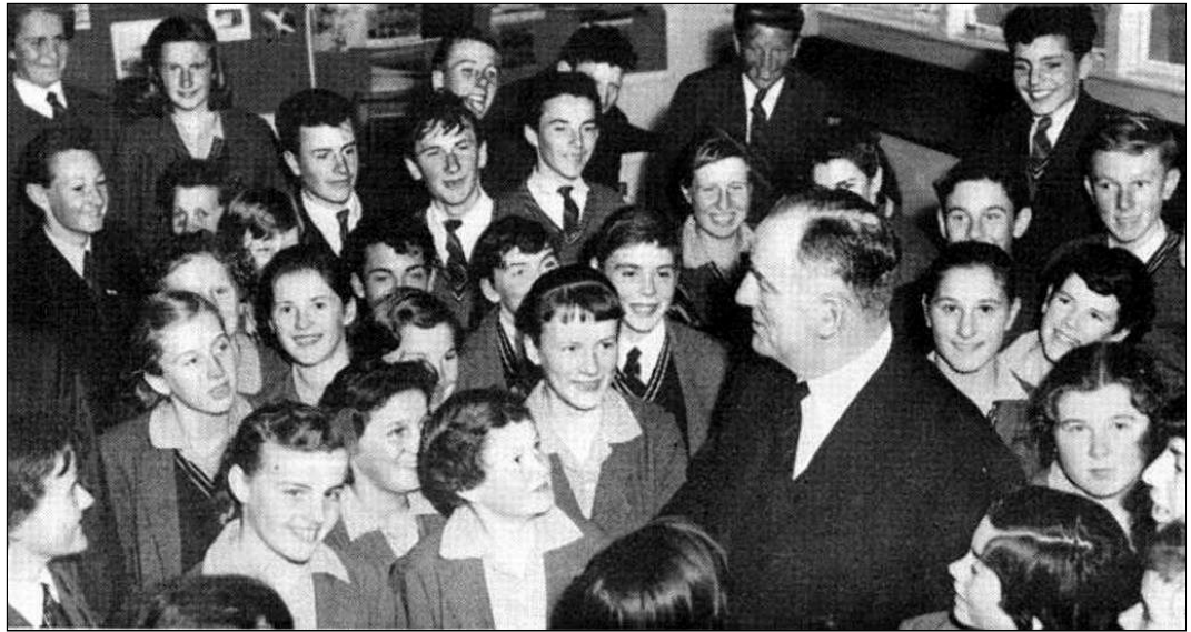
The Minister of Education with students at the Opening of the School 1958.