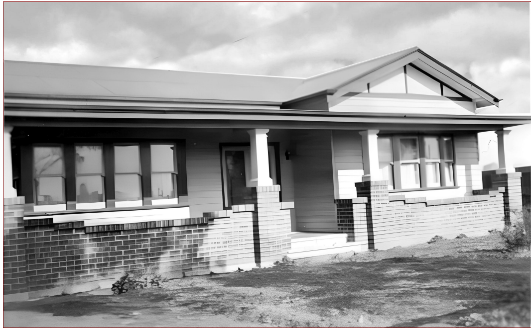
Hounslow home in Main Road East.