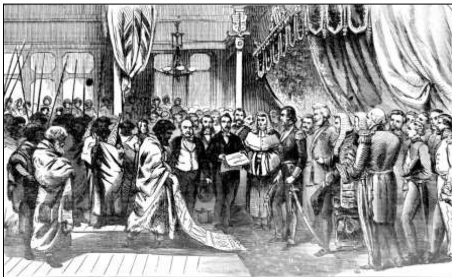
Petition to Governor Barkly, Melbourne Leader 30 May 1863 p1

Simon Wonga and William Barak started applying their traditional diplomacy protocols in their new environment. Indigenous society had evolved sophisticated formal negotiations between tribal groups for purposes such as sharing of resources, travel across country, trade, marriage arrangements, and conflict resolution. Wonga and Barak were soon targeting a new audience. In 1863 they led a deputation of Wurundjeri and Taungurong people to attend Governor Sir Henry Barkly’s public celebration in the Exhibition Building of the Queen’s birthday and the marriage of the Prince of Wales. They presented Barkly, as the vice-regal agent of Queen Victoria, with gifts for the Queen and Prince. 23 There was even a picture of the presentation to the Governor published as front page news in a Melbourne newspaper. 24