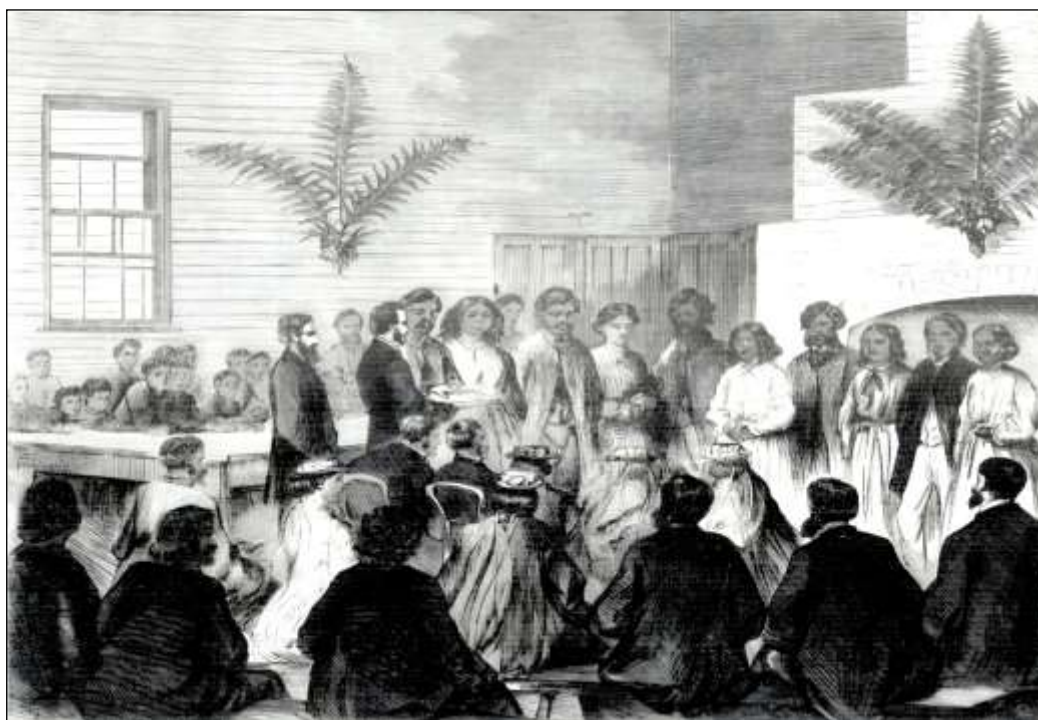
Wedding at Coranderrk, Illustrated Australian News for Home Readers 5 April 1868 p8

Victoria enacted the Aborigines Protection Act in 1869, which was designed to control the movement of Aborigines, including regulation of residence, employment and marriage. This loss of agency would have been a bitter psychological blow for people who were previously self-governing, now having to get permission not only to marry, but also for minor matters such as having outside visitors or visiting relatives offsite, obtaining temporary offsite employment, and even taking a few days off for a cultural walkabout. Important cultural practices such as corroborees were banned. The Act excluded people of mixed parentage from their definition of an Aboriginal, and barred anyone not of full descent and those of mixed descent over 35 years of age from all reserves - the contemporary European view was that only people of full-descent who clung to their ancient customs were real Aborigines. This broke up the Coranderrk population which included orphans of mixed parentage - those least able to support themselves became fringe dwellers on the edge of British colonial society. 28