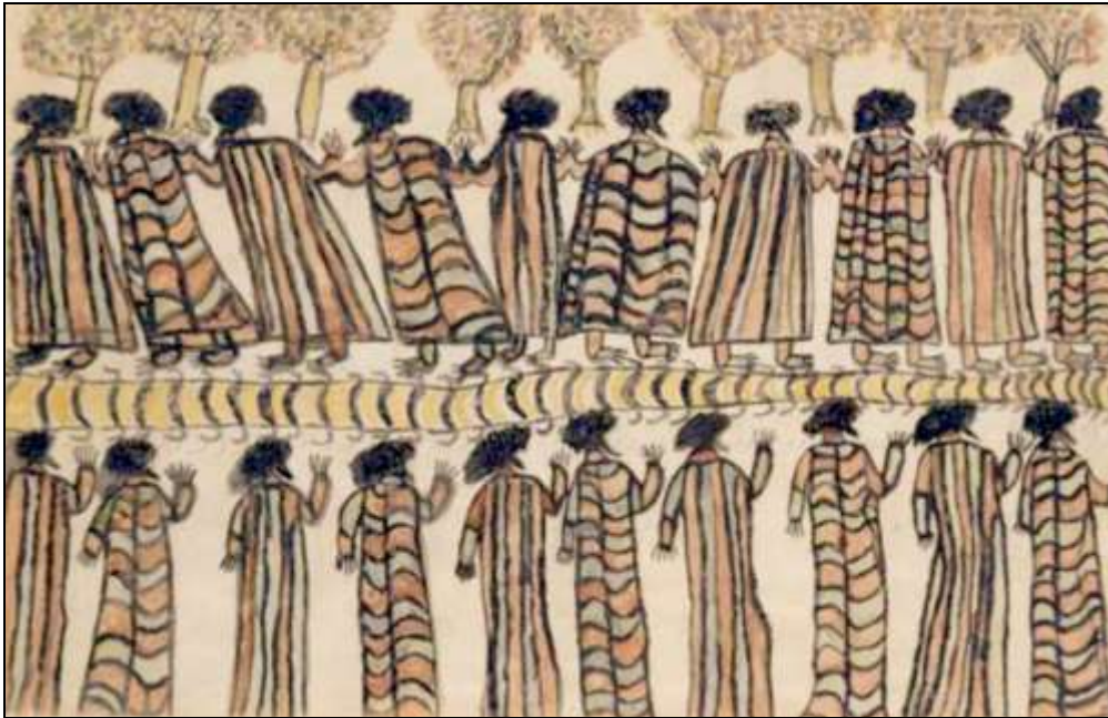
Figures in Possum Skin Cloaks by William Barak 1898